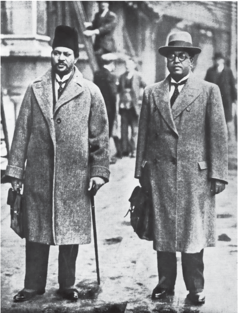
Dr. Ambedkar with Mr. Muhammad Zafrulla Khan arriving at the House of Lords for the Third R. T. C. in 1932